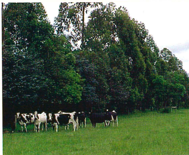
Effective shade and shelter for livestock, and great Habitat for local wildlife