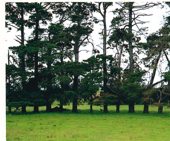
A barren place for stock and wildlife